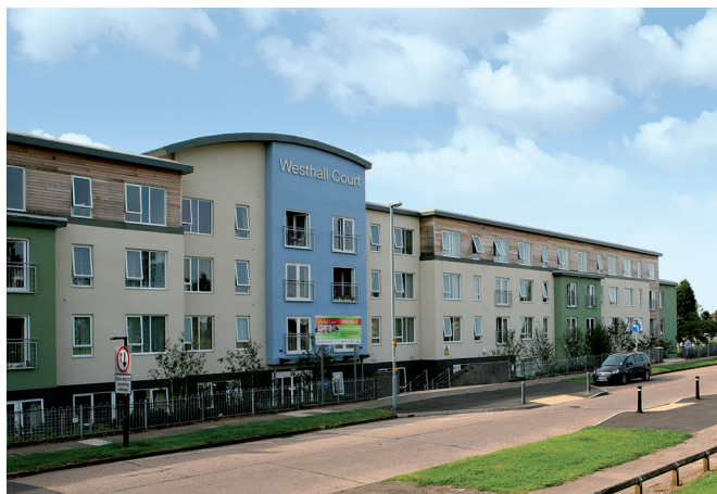
Figure 2 Multi-storey light steel frame housing

BRE Green Guide ratings for different forms of framing and cladding systems are presented in Table 3. The Green Guide ratings range from A+ to E and it can be seen that light steel systems consistently score A+ or A whereas heavyweight systems score D or E.