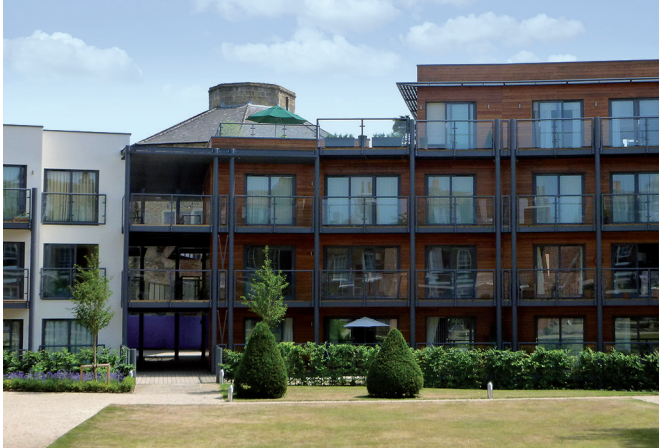
Figure 4 Light steel development in Abingdon (Image courtesy of Metek UK)