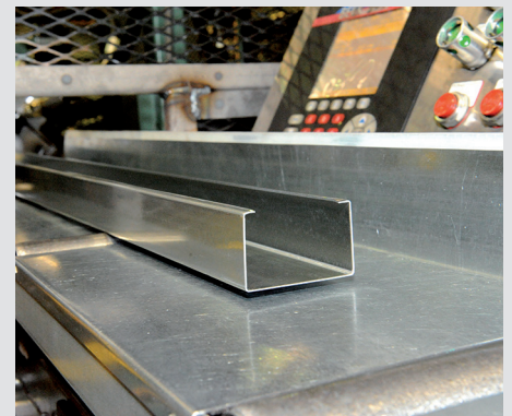
Zero waste from sections produced to length in factory