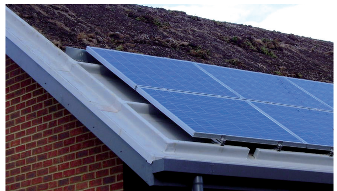
Figure 3 Integration of PV panels and green roof in modular construction

An A+ rating gains two additional points under the materials ratings in the Code for Sustainable Homes.