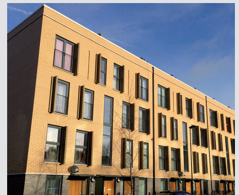
Houses development in London